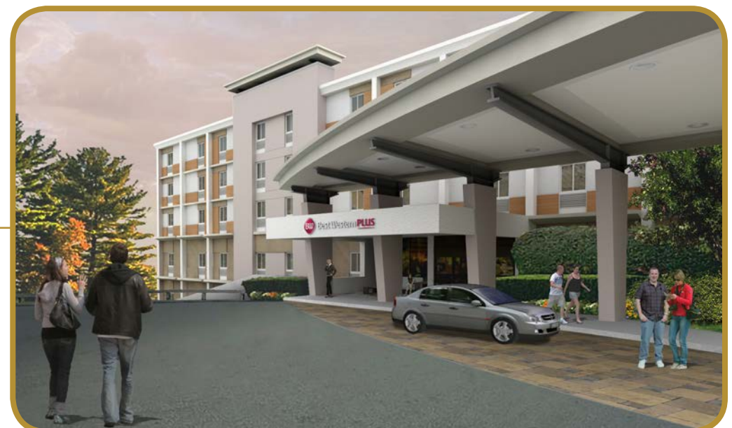
option 3 : photorealistic