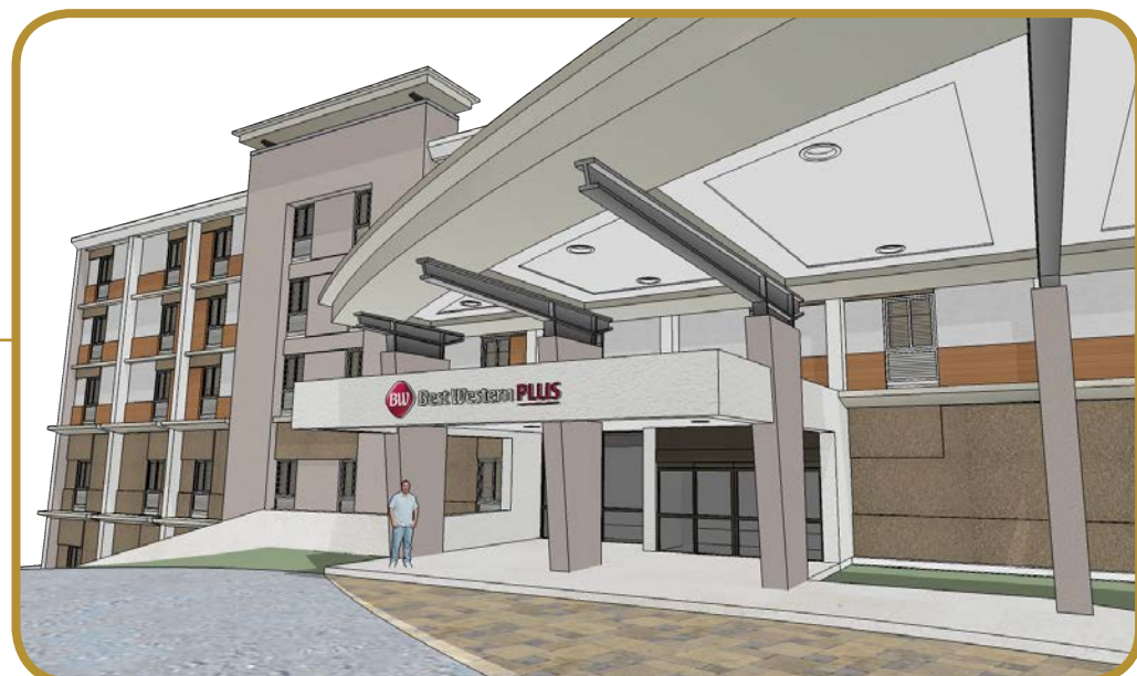
option 2 : 3d model